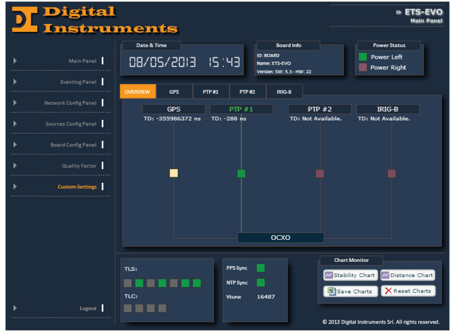
ETS-EVO<sup>2</sup> web GUI