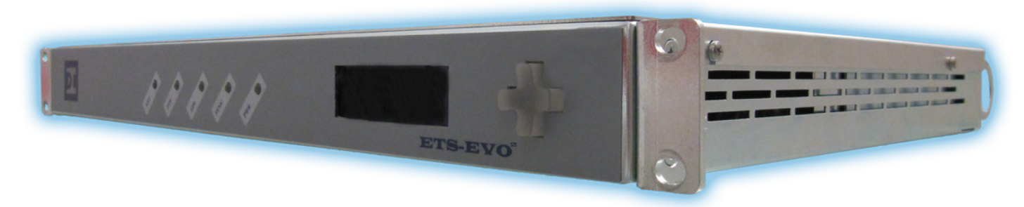
ETS-EVO<sup>2</sup> Front Panel (with display option)

Display and crosspad can be available on front panel as option.